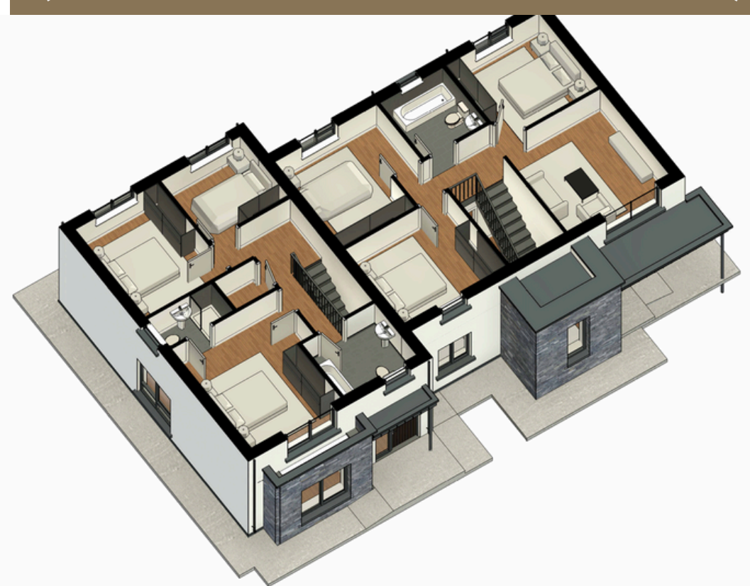
FIRST FLOOR PLAN LAYOUT HOUSE TYPE B & C