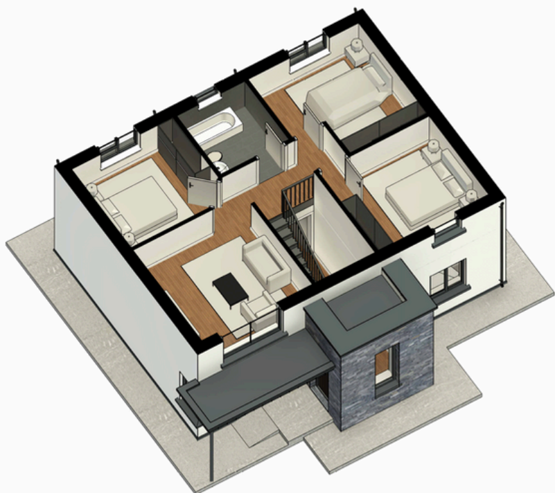
FIRST FLOOR PLAN LAYOUT HOUSE TYPE B